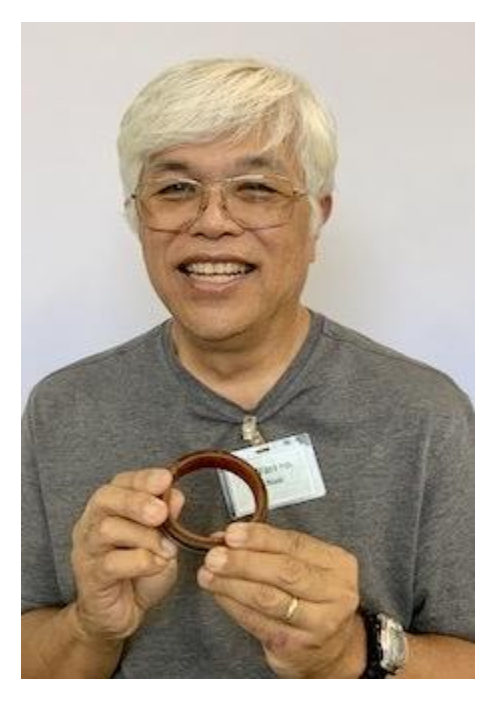
Warren Naai Lychee, Pheasantwood, Turquoise